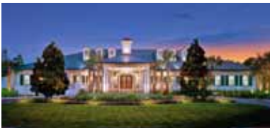
The Founders Club, Sarasota, FL