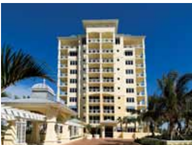
Orchid Beach Club, Sarasota, FL