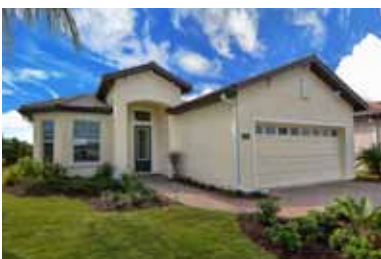
Grand Oaks Sabal, Venice, FL