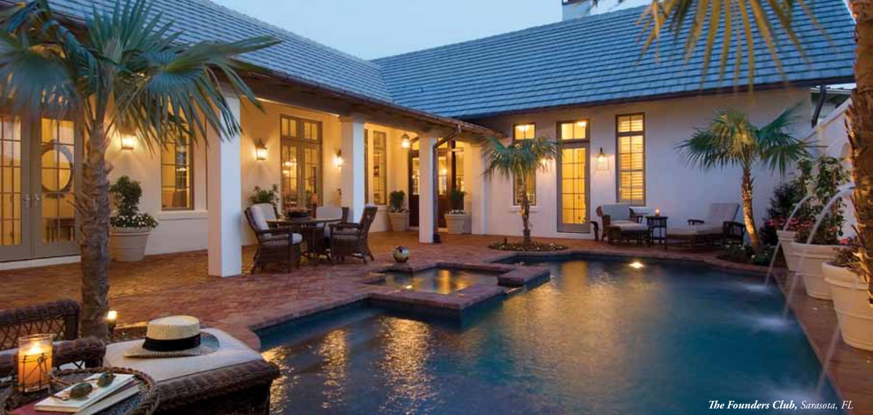
The Founders Club, Sarasota, FL